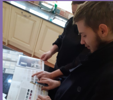
Picking out swatches as part of Homes and Horizons

You can get involved in the following ways: