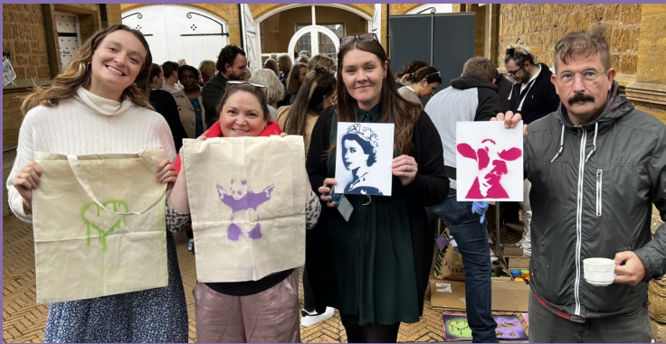
The SiCC & SLCC graffiti session

SiCC & SLCC stands for the Somerset In Care Council and the Somerset Leaving Care Council. We ensure that the voices of children looked after and care leavers are included within the planning and reviewing of services.