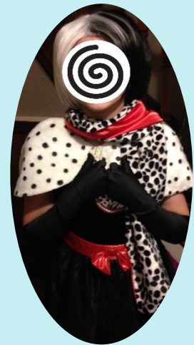
A member of S&S dressed up as Cruella De Ville